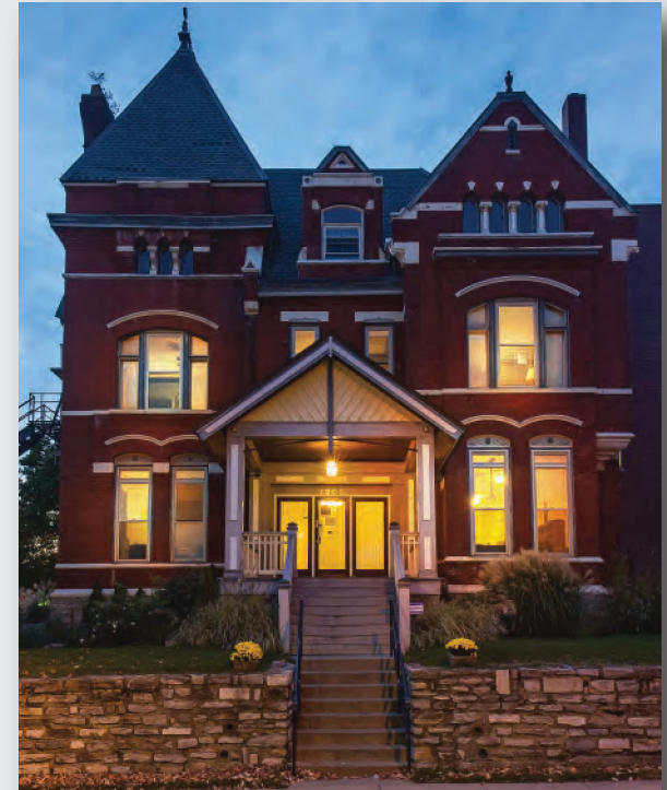
• THE PREMIER ADDICTION TREATMENT CENTER FOR WOMEN IN CINCINNATI, OHIO

Renovation will soon begin for the 23-unit apartment building known as the Lillie Lee. With the help of a city award in the amount of $250,000, we will move forward with a complete renovation of the building.